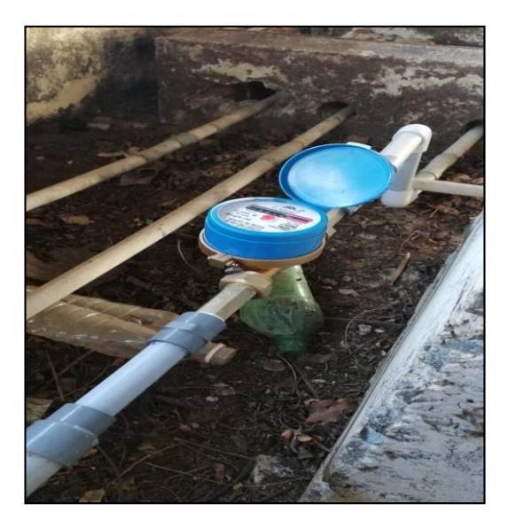
Fig. 3.11 Water Meter at Staff Apartment