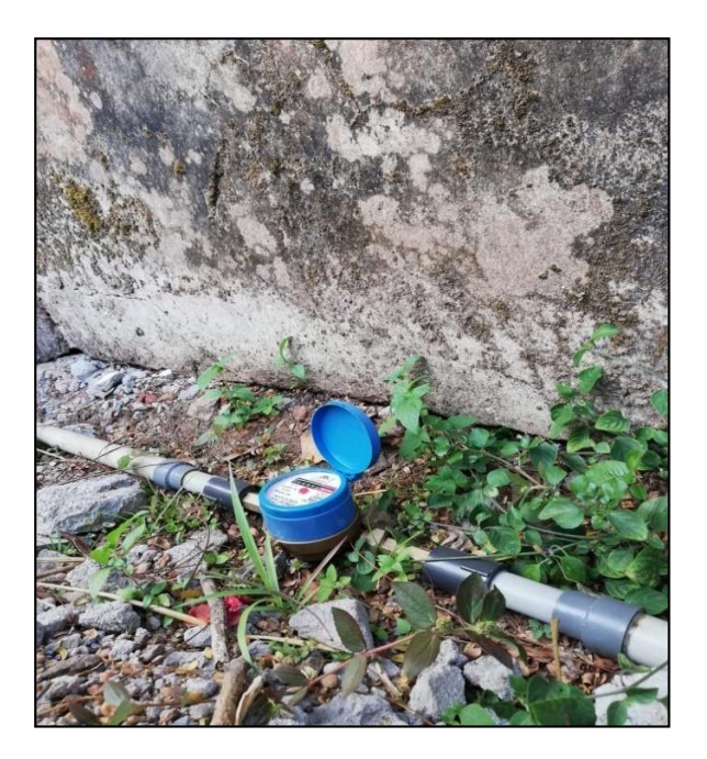
Fig. 3.6 Water meter at Canteen

The water meter was installed behind the canteen in the main inlet pipe to the storage tank of the canteen. The water supply was turned off by closing the valve, while the metering installation proceeded. The inlet pipe to the main tank was cut, long enough to accommodate a meter and its side pipe extensions attached to the FTA and reducers. The meter extensions were bonded to the cut pipe with the help of star-bond and after a few minutes of drying up, the valve was turned on again.