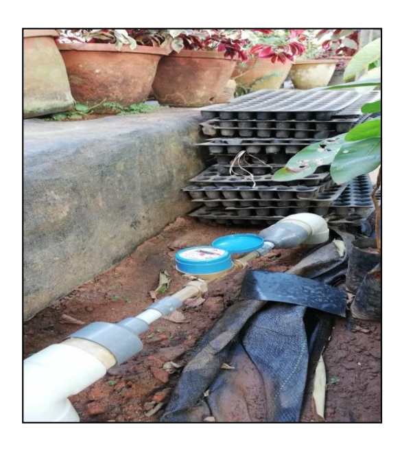
Fig. 3.7 Water Meter near Shade House of PFDC

The pipe being very close to the ground level, installation of water meter in the shade house required the usage of elbows. The valves supplying water to the shade house were closed and the pipe was cut. The leaked water was drained out. The elbows were inserted and bonded with the help of star-bond. The water meter side extensions were fitted with the reducers and FTA. It was then adjusted according to the length of the cut portion and fitted with elbows. This was followed by insertion of the meter with its extensions into the elbows fixed along the cut portion. After a few minutes of drying up of the bond, the valve was turned on again.