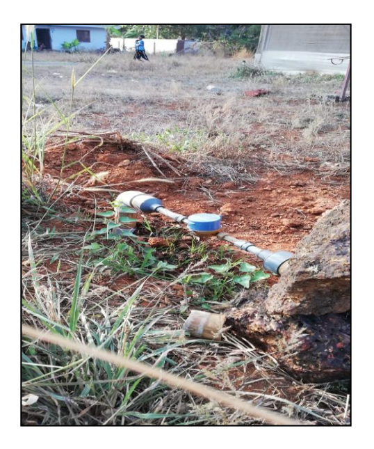
Fig. 3.10 Water Meter at Staff Duplex