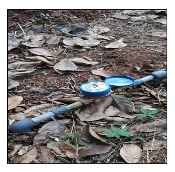
Fig. 3.9 Water Meter at Farm Nursery

The pipe being very close to the ground level, installation of water meter required the usage of elbows. The valves supplying water to the poly houses were closed and the pipe was cut. The leaked water was drained out. The elbows were inserted and bonded with the help of star-bond. The water meter side extensions were fitted with the reducers and FTA. It was then adjusted according to the length of the cut portion and fitted with elbows. This was followed by insertion of the meter with its extensions into the elbows fixed along the cut portion. After a few minutes of drying up of the bond, the valve was turned on again.