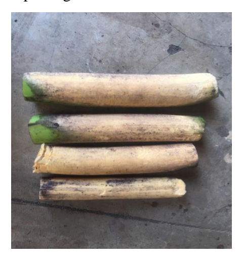
Plate 4.1 Plantain after mechanical peeling

From the values, it is revealed that the material loss depends on the shape and size of the plantain. For a particular feeding cylinder, it was found that the percent material loss increases with weight of the plantain. This may be due to the constant size of the circular peeling blade.