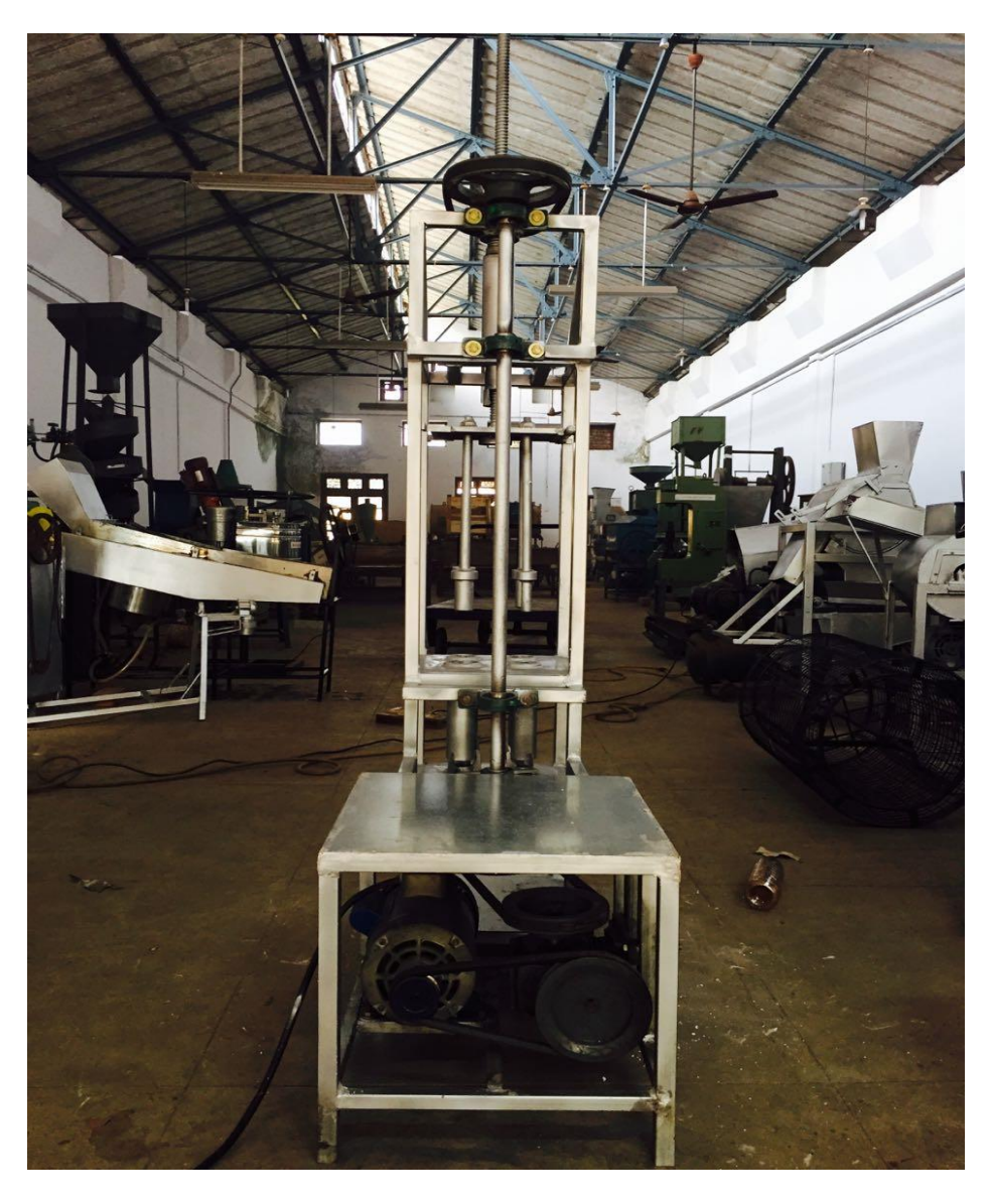
Plate 3.1. Power Operated Plantain Peeler