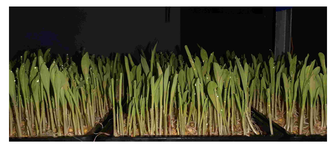
Fig. 4. Green fodder

Total cost of the fabrication was Rs.17030. Total cost of production was Rs. 69 per day. Benefit cost ratio of the equipment was 1.60.