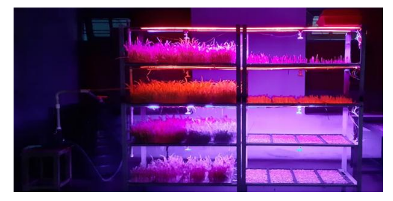
Fig. 3. Developed green fodder production unit