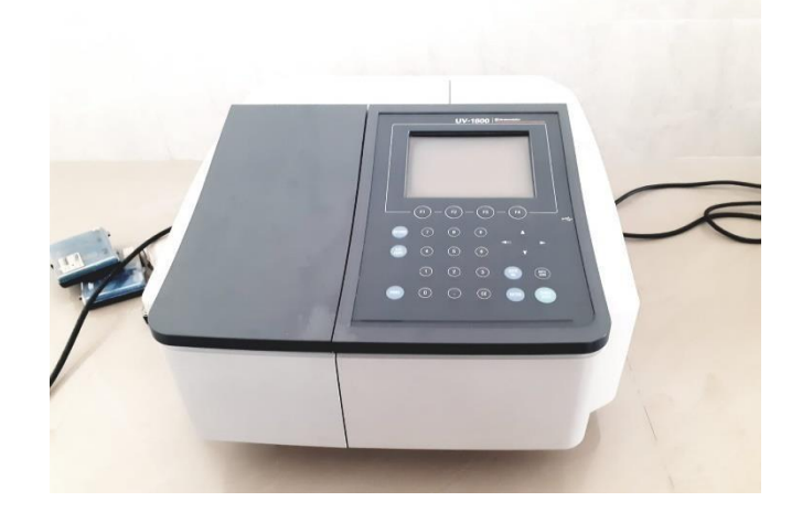
Plate 4. Spectrophotometer

In the present study, the total carbohydrates of selected cakes were estimated by using anthrone reagent and incubating the samples in boiling water bath and recording the absorbance at 630 nm using a spectrophotometer against a blank reagent according to the method described by Hedge and Hofreiter (1962).