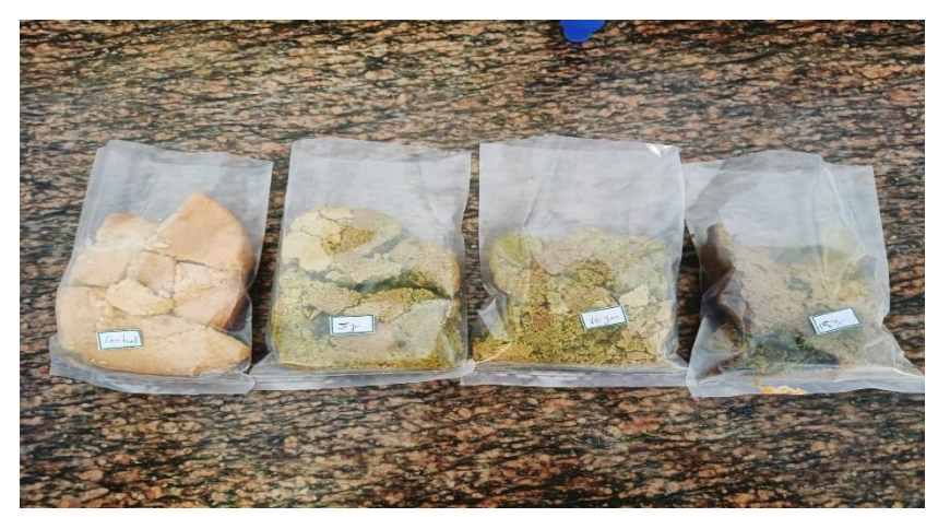
Plate 8. The cake samples with different MOLP formulations