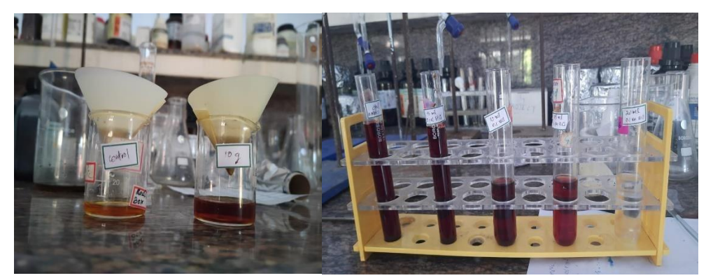
Plate 7. Analysis of iron content

Iron content of fortified cake was found to be 12.59mg, which is higher than the unfortified which contain only 0.96mg. So, it is clear that, the fortification of the cake with MOLP increased the iron content, which is highly beneficial for the anaemic patients.