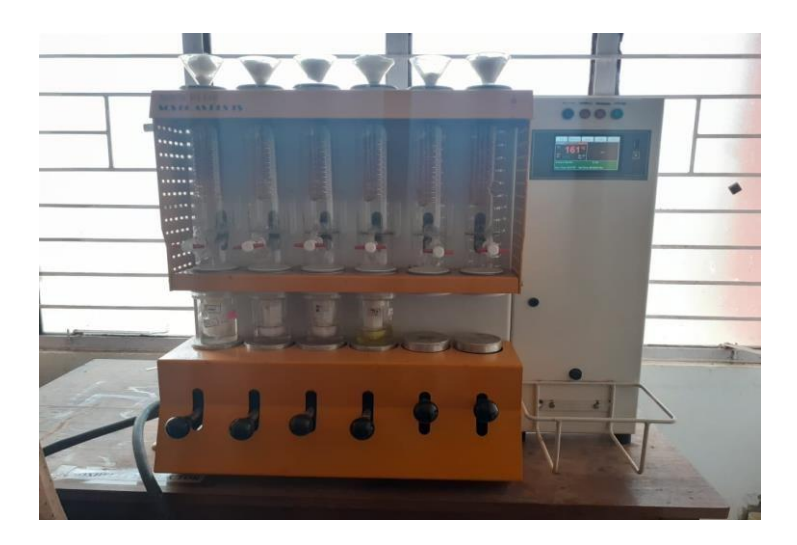
Plate 6. Soc-plus Soxhlet apparatus