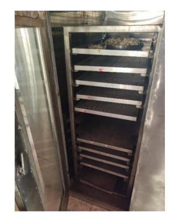
Plate 3. Cabinet dryer