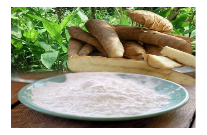
Plate 2. Arrowroot powder

Arrowroot powder was procured from market.