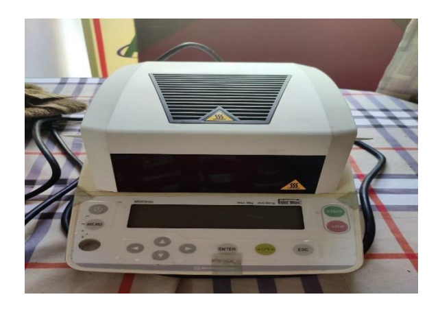
Plate 5. Infrared moisture analyser

Moisture content is one of the most commonly measured properties of food materials. Stability and quality of a food product depends upon the moisture content present in it. Moisture content was determined using a digital infrared moisture analyser. The equipment determines the moisture of a sample by heating and drying it with infrared irradiation and displays the moisture content from changes in mass due to evaporation.